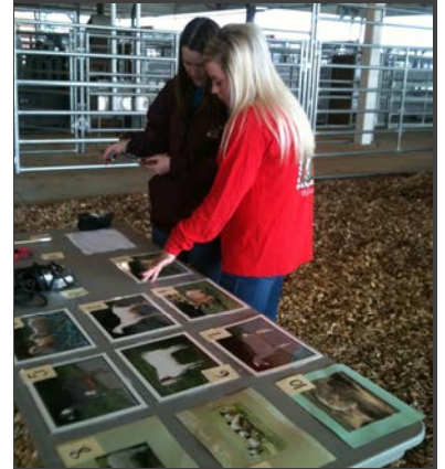
Academic Quadrathlon students in action