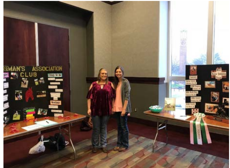
MSU Horseman's Association booth (left) and MSU Horse Judging Team booth (right) at Academic Insight