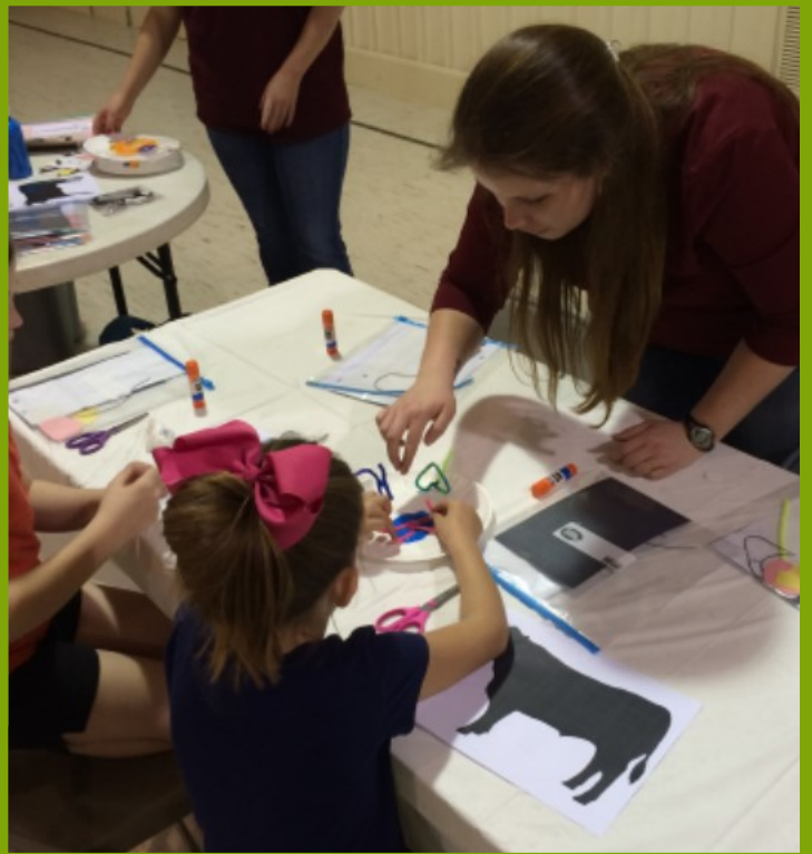
Capstone and Webster county students