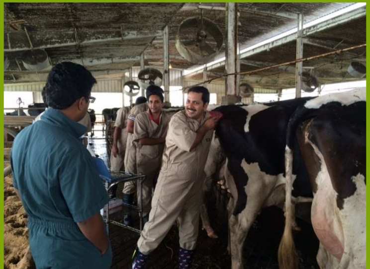
UVAS, Lahore, Pakistan group at the Bearden Dairy Research Center