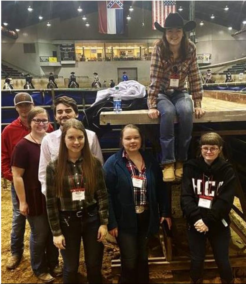
ADS 3221 Students working at the 2020 Dixie National Quarter Horse Show.

The students enrolled in ADS 3221: Practices in Horse Care & Management, got the opportunity to work at the Mississippi Quarter Horse Show at Dixie Nationals in Jackson, MS in February. The students got to volunteer working various aspects of the show at both the Coliseum and the Equine Center. The students helped various horse professionals as they put on the South's largest Quarter Horse show.