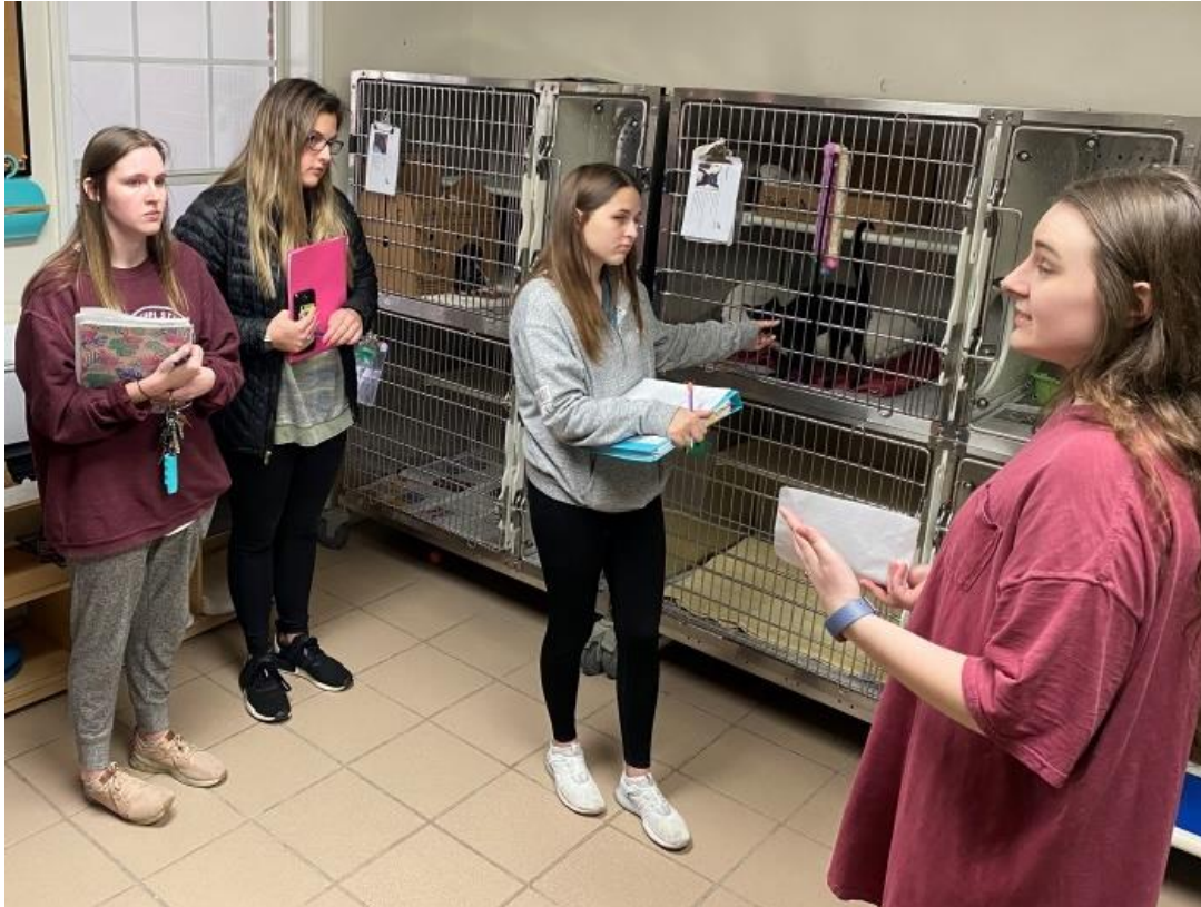
ADS 2221 students tour the cat room at the Oktibbeha County Animal Shelter.