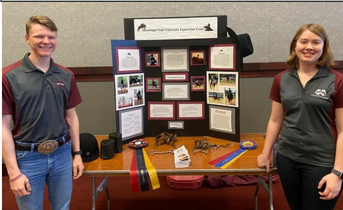
MSU Equestrian Team Members at Academic Insight.

involved in these activities learning more about what these organizations do and how to get involved. Students wanting further information about the equine activities associated with the ADS Department can refer to the ADS department website located at https://www.ads.msstate.edu/ .