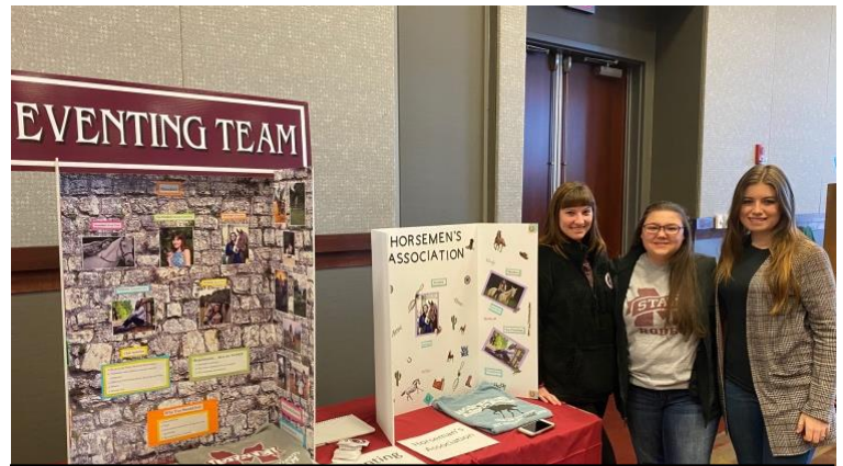
MSU Eventing Team and Horseman's Association Officers at Academic Insight.

During Academic Insight held in mid-February, equine clubs recruited and met with incoming freshmen and their families to showcase activities they are involved in during the year. The equine program of the Animal & Dairy Sciences Department had a strong representation at the event with multiple equine clubs and their members present, including the Equestrian Team,