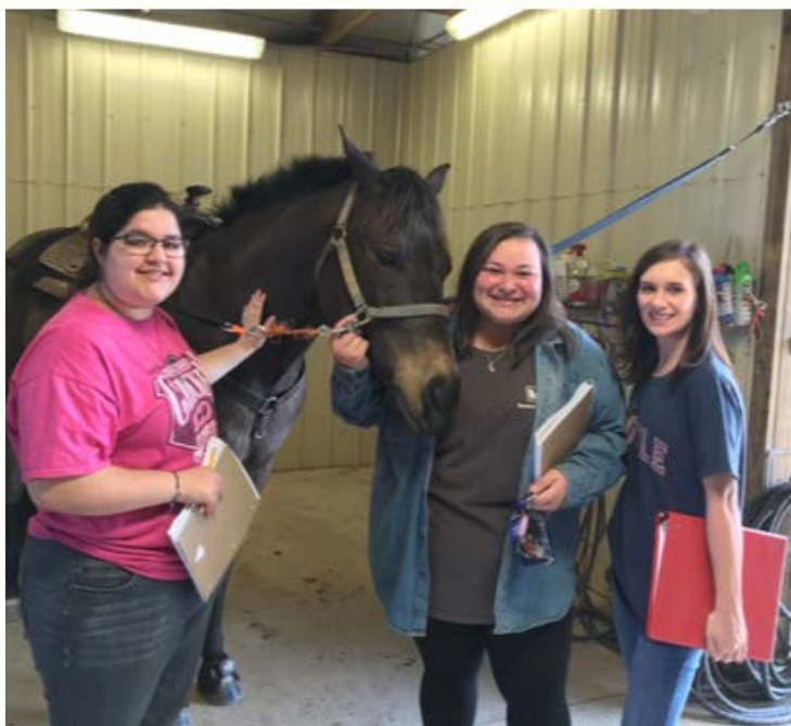
ADS 3221 students touring Hickory Grove Stables