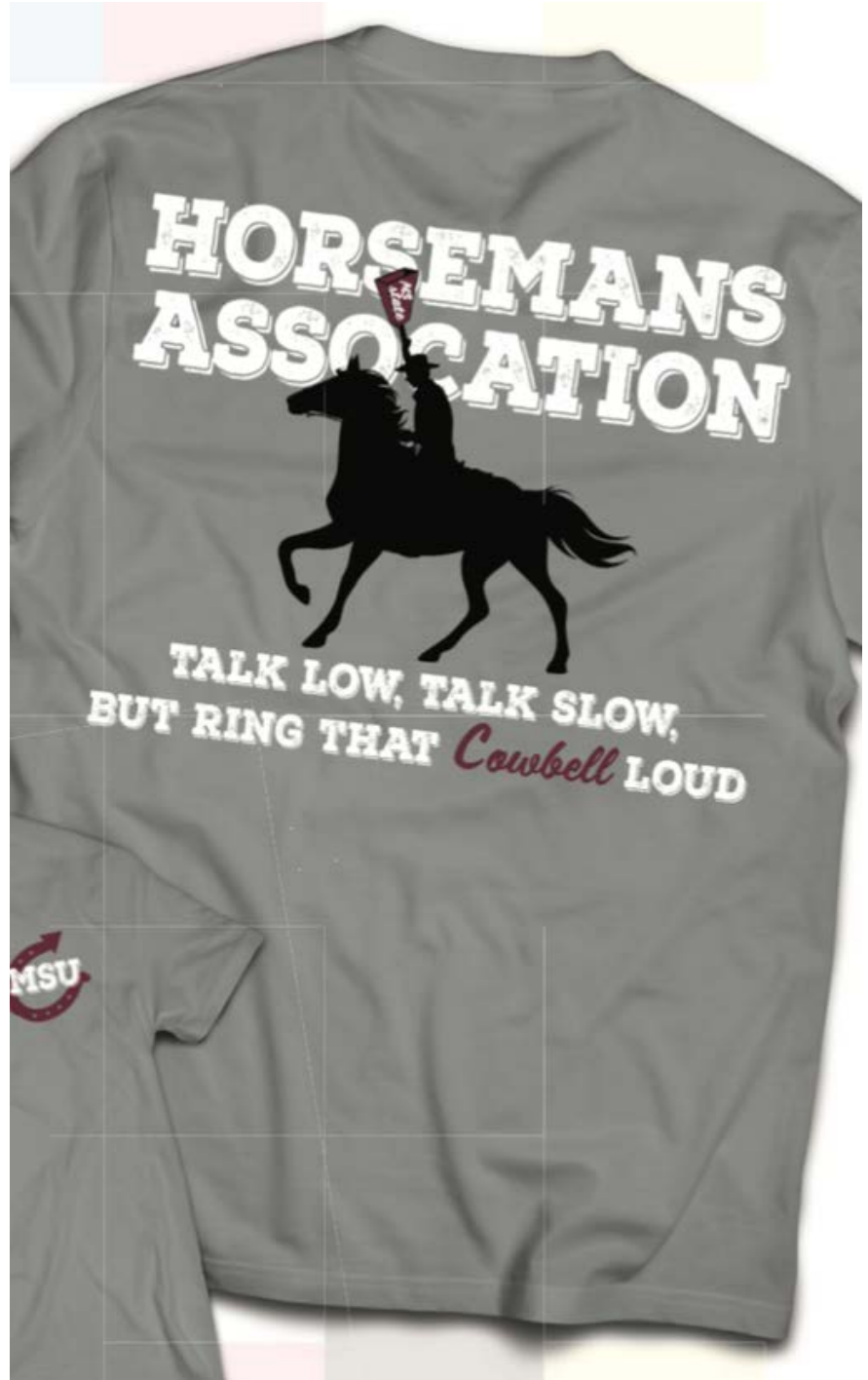
2018-2019 Horseman's Association T-Shirt Design